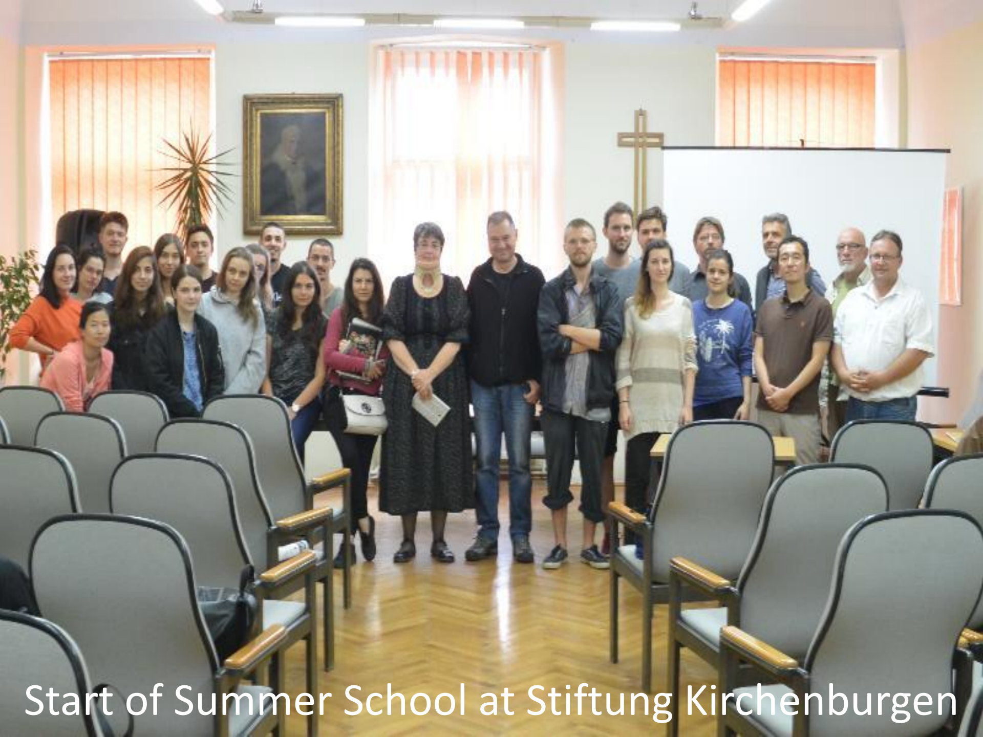
Start of Summer School at Stiftung Kirchenburgen