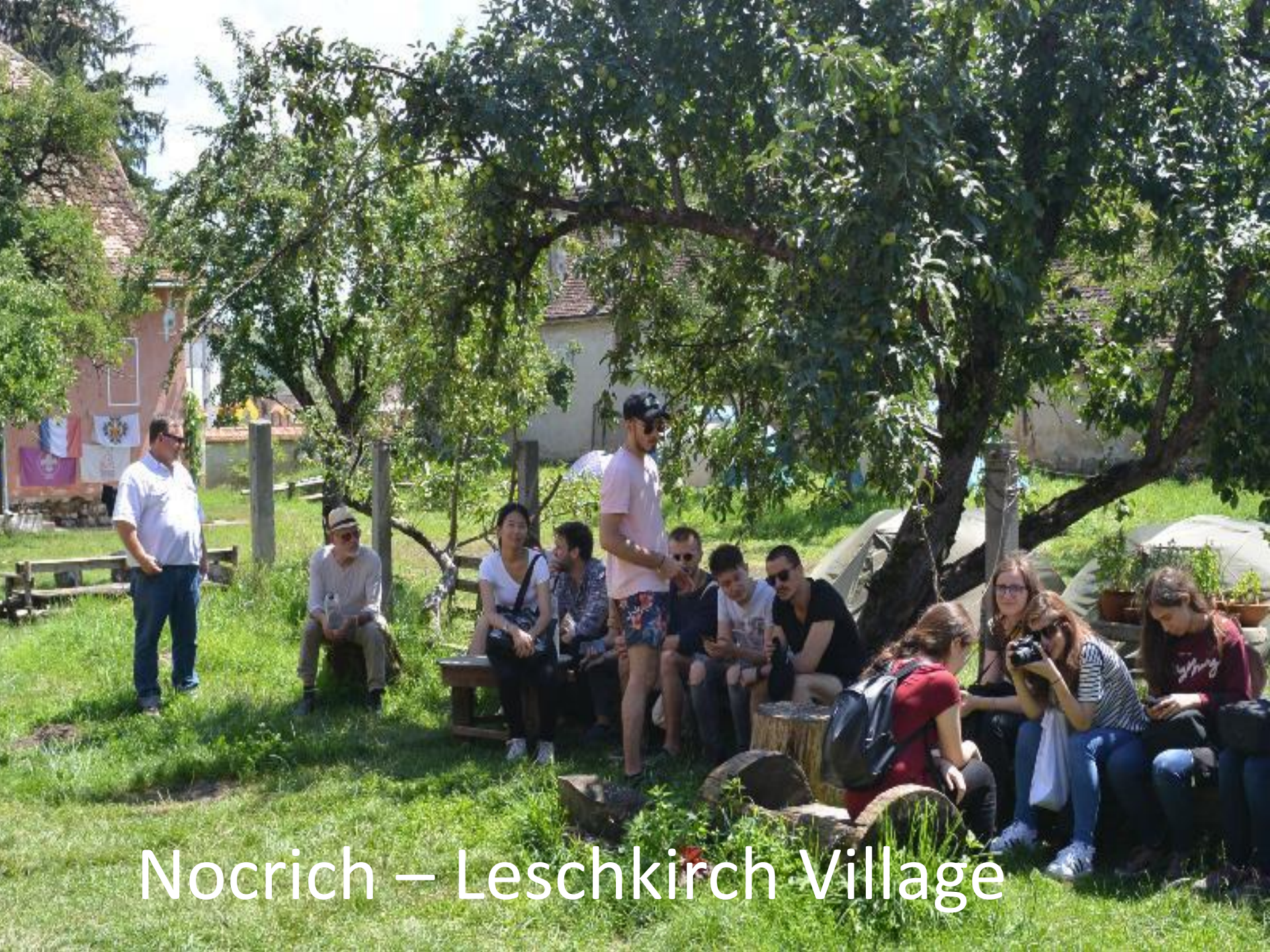
Nocrich – Leschkirch Village