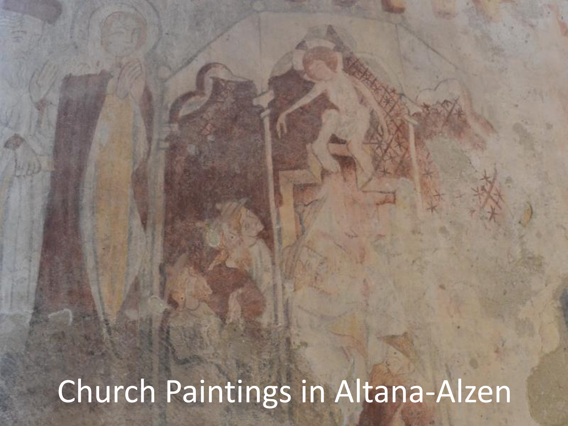
Church Paintings in Altana-Alzen