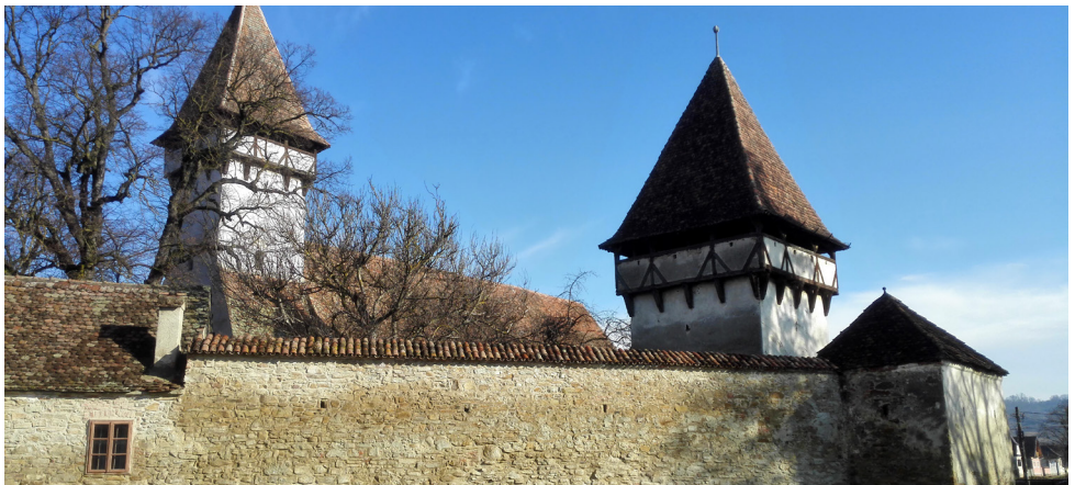
Fig. 3 M. Breiling, Feb 2016