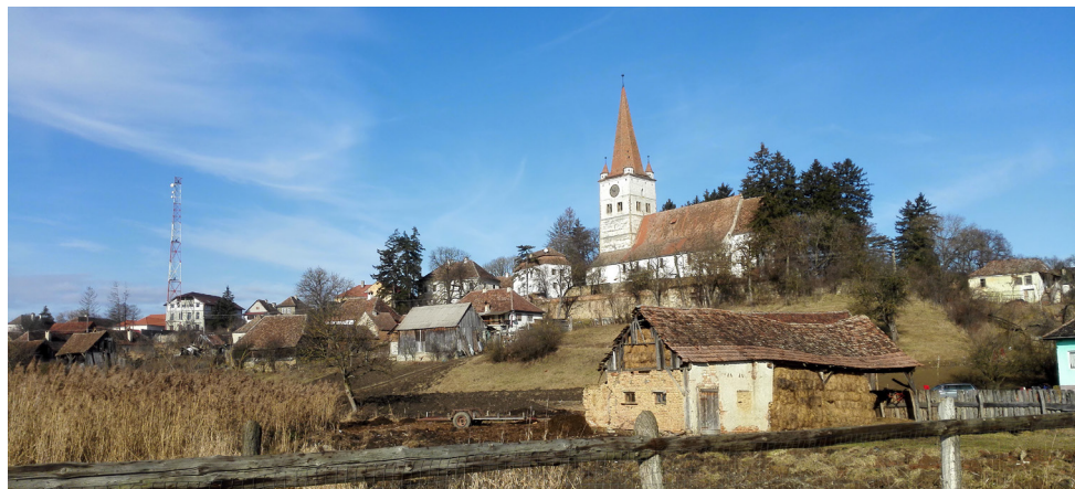
Fig. 4 M. Breiling, Feb 2016