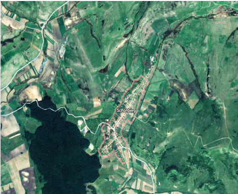
Fig 2. Google Maps