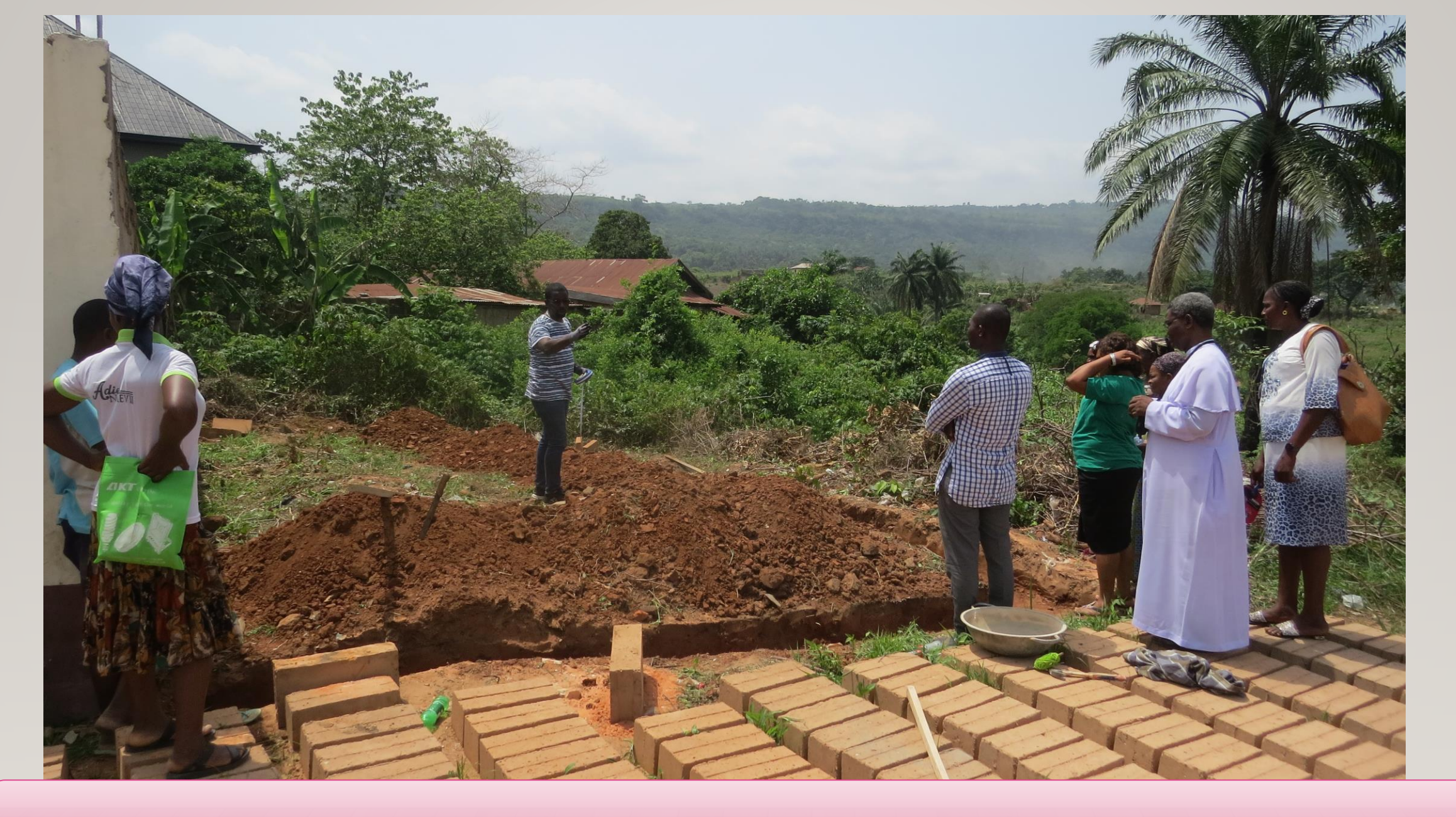
HIFA project site in Abia state for the small animal production