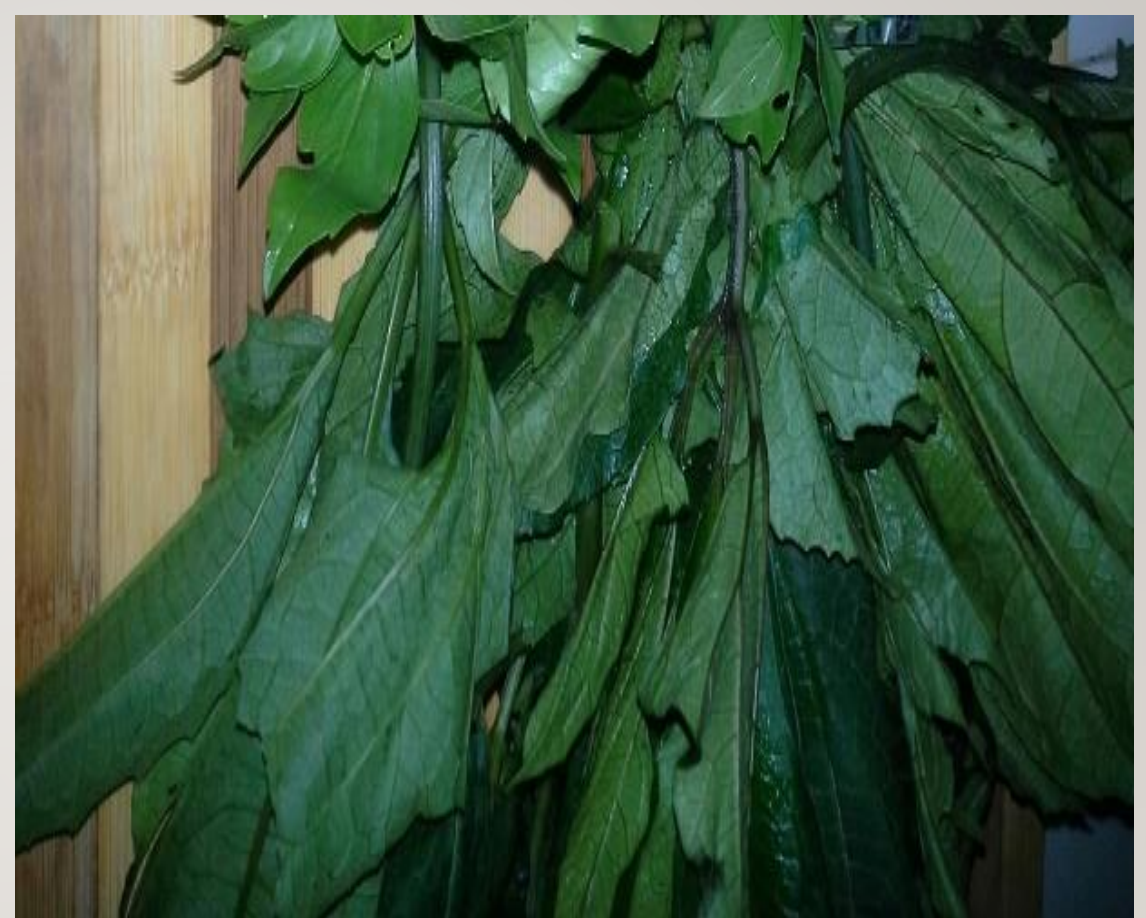
Ugu fruit and leaf production for human consumption and animal feeds