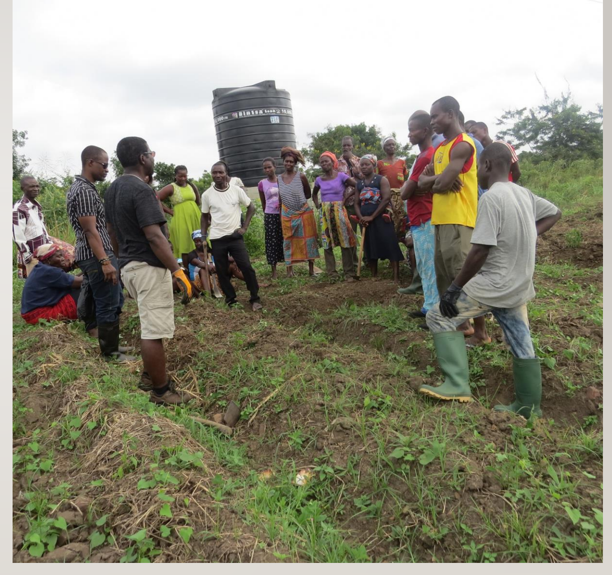
searching the best way of cultivating a healthy soil