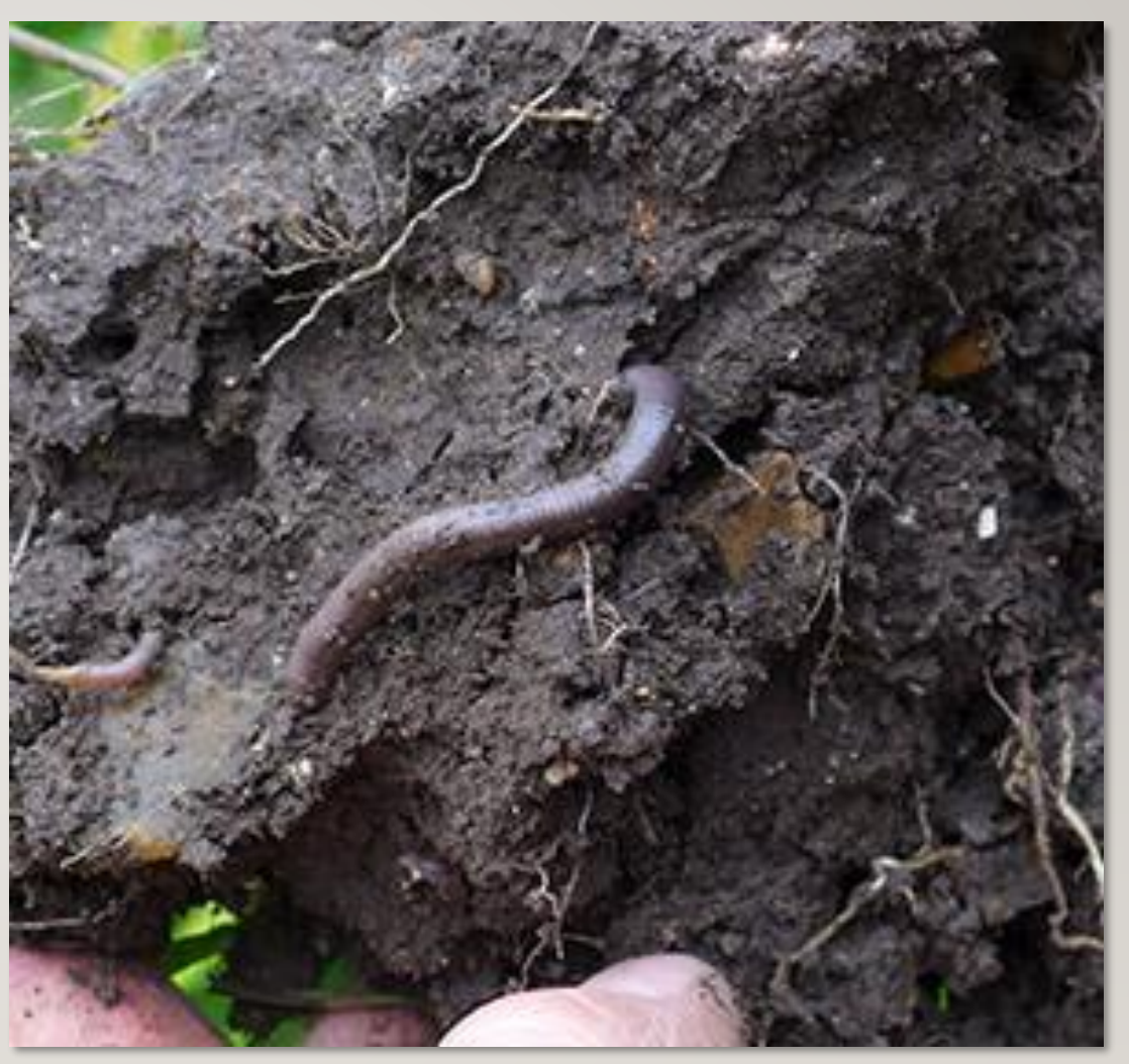
How healthy is our soil?