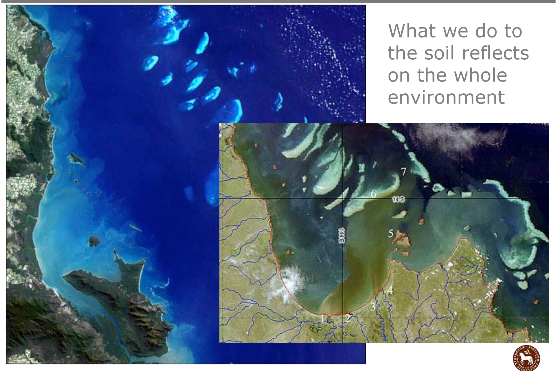
World soil day 2007 Austria